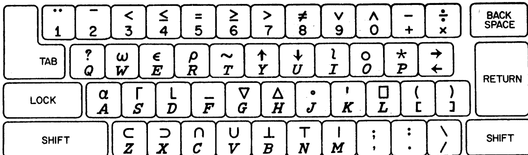
Figure 1.2: KEYBOARD

Use of other character sets. The part numbers of APL printing elements are given in Table 1.1. However, any printing element may be used with the APL system, since the encoded characters generated by the keyboard and transmitted to the computer are independent of the particular element mounted on the terminal. Subject to programmed intervention, the transmitted information will always be interpreted according to the APL keyboard characters.